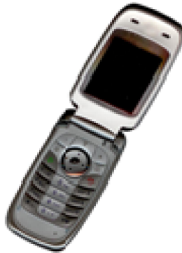
Fig. 2. Example of an unacceptable low-resolution image

Page numbers, headers and footers must not be used.