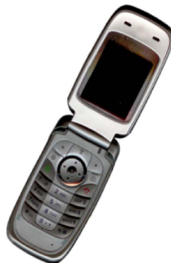
Fig. 3. Example of an image with acceptable resolution