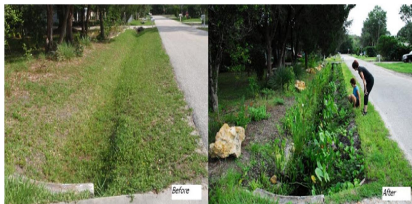
Fig. 2: Build a Rain Garden and Bioswale

e. Human Activities: Identifying nearby sources of pollution, such as roads, parking lots, or industrial facilities, is essential to minimize potential contaminants entering rain gardens and bioswales.Smith and Pitt (2021) stress the need to consider land use activities and potential sources of pollution during site assessment to protect water quality and ecosystem health.