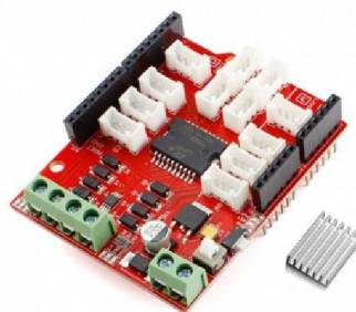
Fig.3. Motor based shield

The ASCII text file Arduino atmosphere permits the user to put in writing code and transfer it to the I/O board. The environment is written in Java. Arduino development atmosphere contains a text editor for writing code, message space, text console, and toolbar with buttons for common functions, and a series of menus. It connects to the Arduino hardware to transfer programs and communicate with them. Arduino programs are written in C or C++. Arduino options, capable of compilation and uploading programs to the Board with one click. Software written using Arduino are called sketches