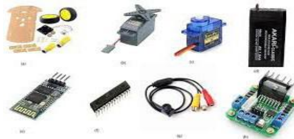
Fig. 1. Basic Idea of Project

going to utilize Arduino Bluetooth Camera with the help of ultrasonic to detect whether a stranger has entered our home and catch a photograph of him consequently once he gets into the region of the ultrasonic wave[2]. There is another similar project of RC robocar in this. The function of this robot car is easy to identify by its name. Truly! You can capture pictures of the encompassing condition by the camera, and transfer video to your Android application. In the meantime, you can control it with your android application. Advantageous and just. We include a dish tilt for giving more extensive view scope of the car. It moves quickly and responds rapidly. You can change the course of care, as indicated by the video. So in the event that you need to “investigate” some spot slender and may harm to your wellbeing, you would remote be able to control your car as motion picture appeared. Obviously, it for playing as well as examining[3] Control from the iPhone ios application by means of Bluetooth connection. Control the GoPro camera via Wi-Fi and suspension using a servo motor. Straightforward FPV mode. Likewise, have Obstacle shirking autopilot with ultrasonic sensor and gyro.[4] This is a simple four-wheeled car that is controllable via Bluetooth connection. The vehicle can hold any mobile phone, which can be used as