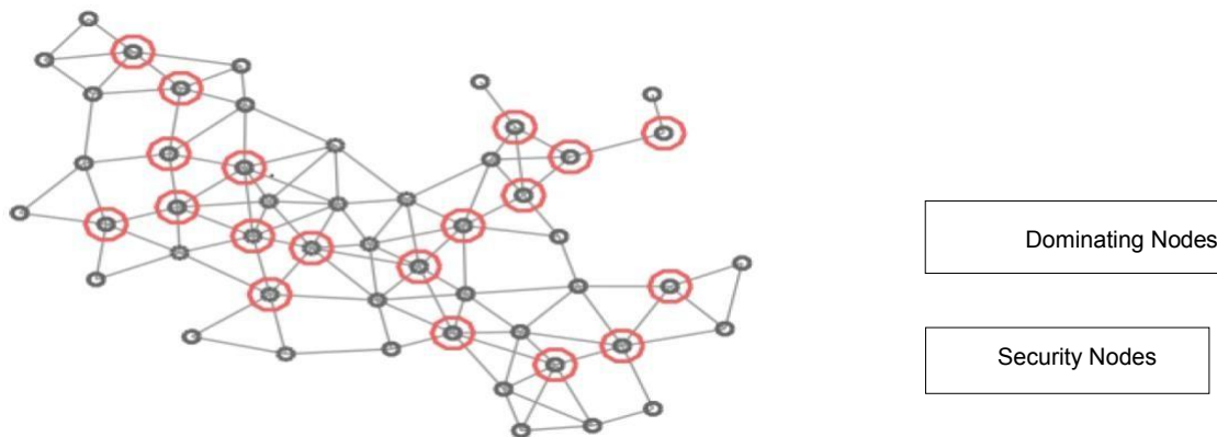
Fig 1: Security Nodes after CDS